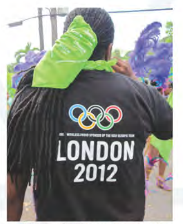
A Choice employee shows support for U.S.V.I. Olympic athletes

revenues continue to decline in Guyana, we intend to manage our transition carefully to a more data-centric world while remaining mindful of the expense and declining margins of our legacy voice services.