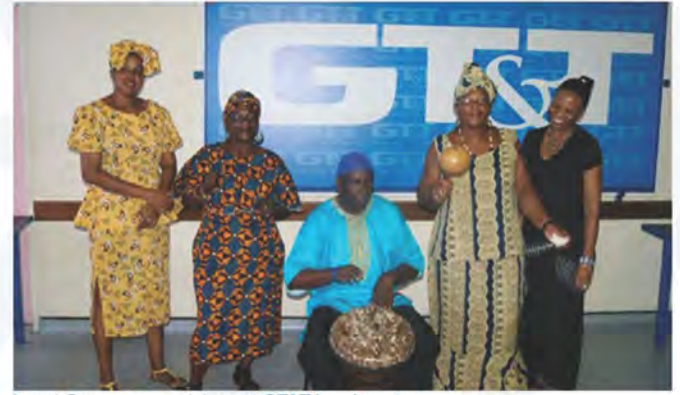
Local Guyanese musicians at GT&T headquarters

Merundoi, a non-governmental organization established by the Guyana Ministry of Health that uses radio serial dramas to educate on social issues such as HIV/AIDS awareness, drug abuse and domestic violence and influence positive behavioral change.